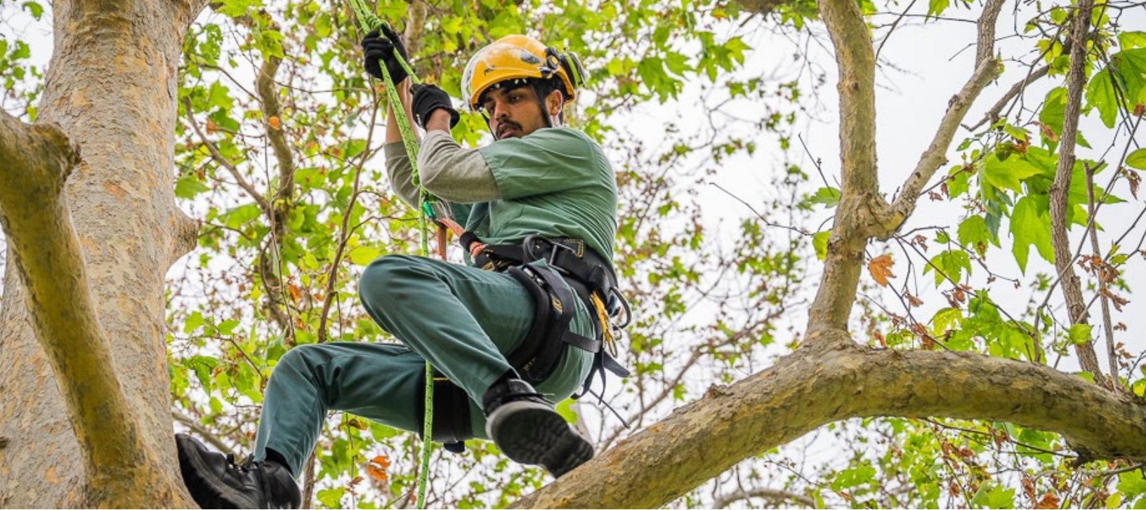
Tree care training at Urban Corps of San Diego County.