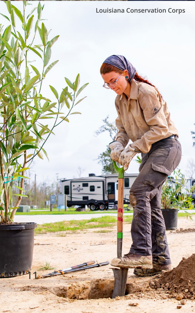
Louisiana Conservation Corps