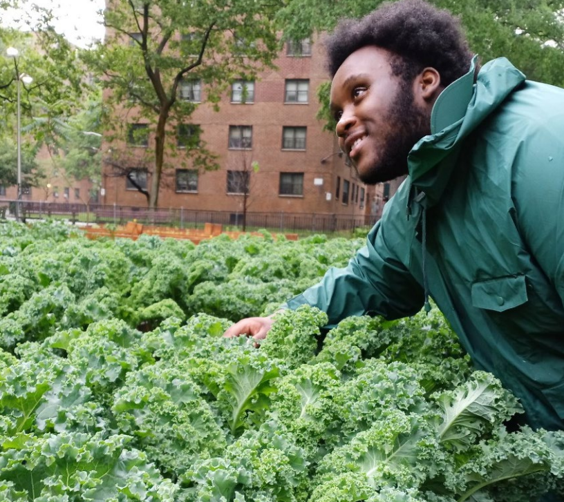
LEFT: Conservation Corps of Long Beach; RIGHT: Green City Force