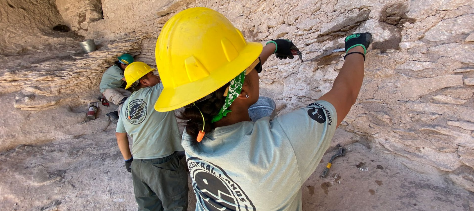
Ancestral Lands Conservation Corps, an OYSI program.