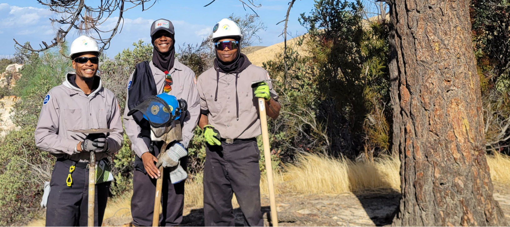
Civicorps members doing trail restoration at Black Diamond Mines.