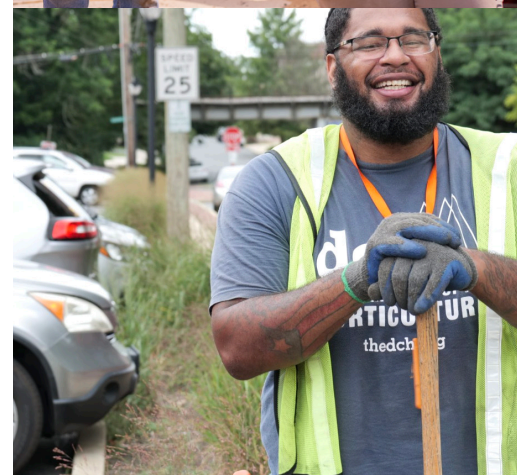
Delaware Center for Horticulture