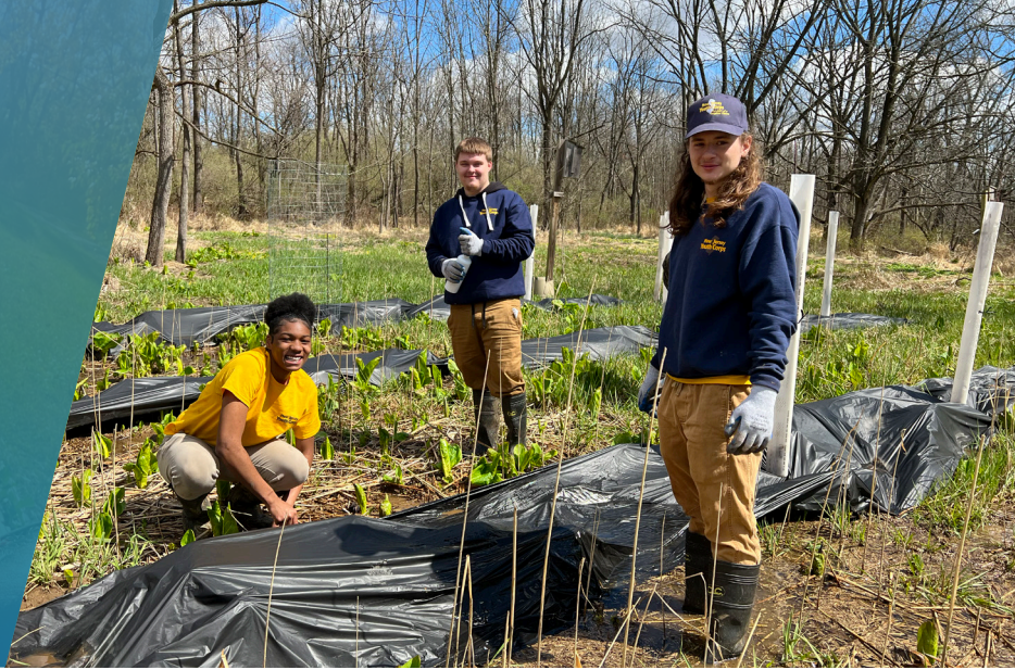
NJYC - Phillipsburg

Promoting Habitat and Community Resilience