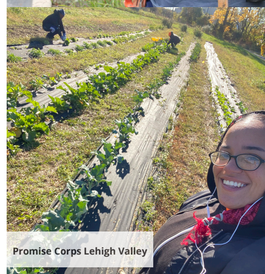
Promise Corps Lehigh Valley