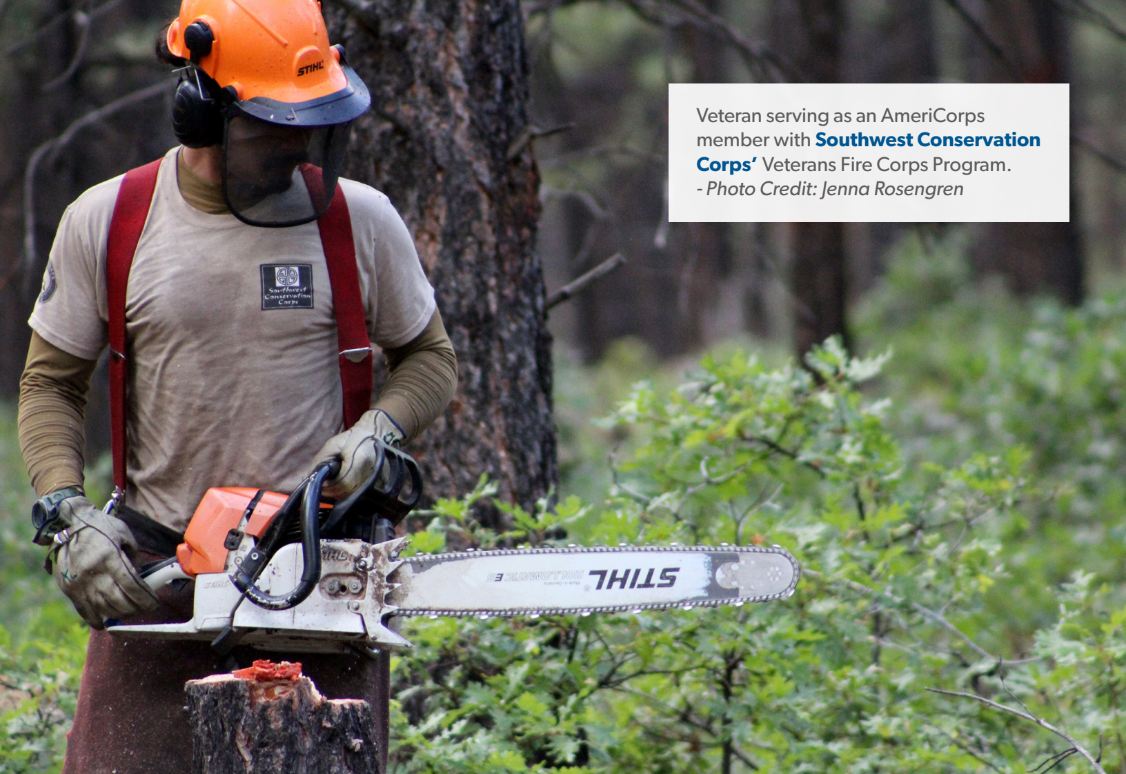
Veteran serving as an AmeriCorps member with Southwest Conservation Corps' Veterans Fire Corps Program.