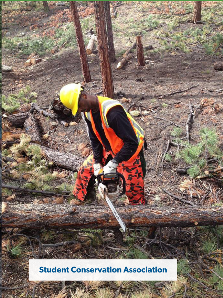
Student Conservation Association