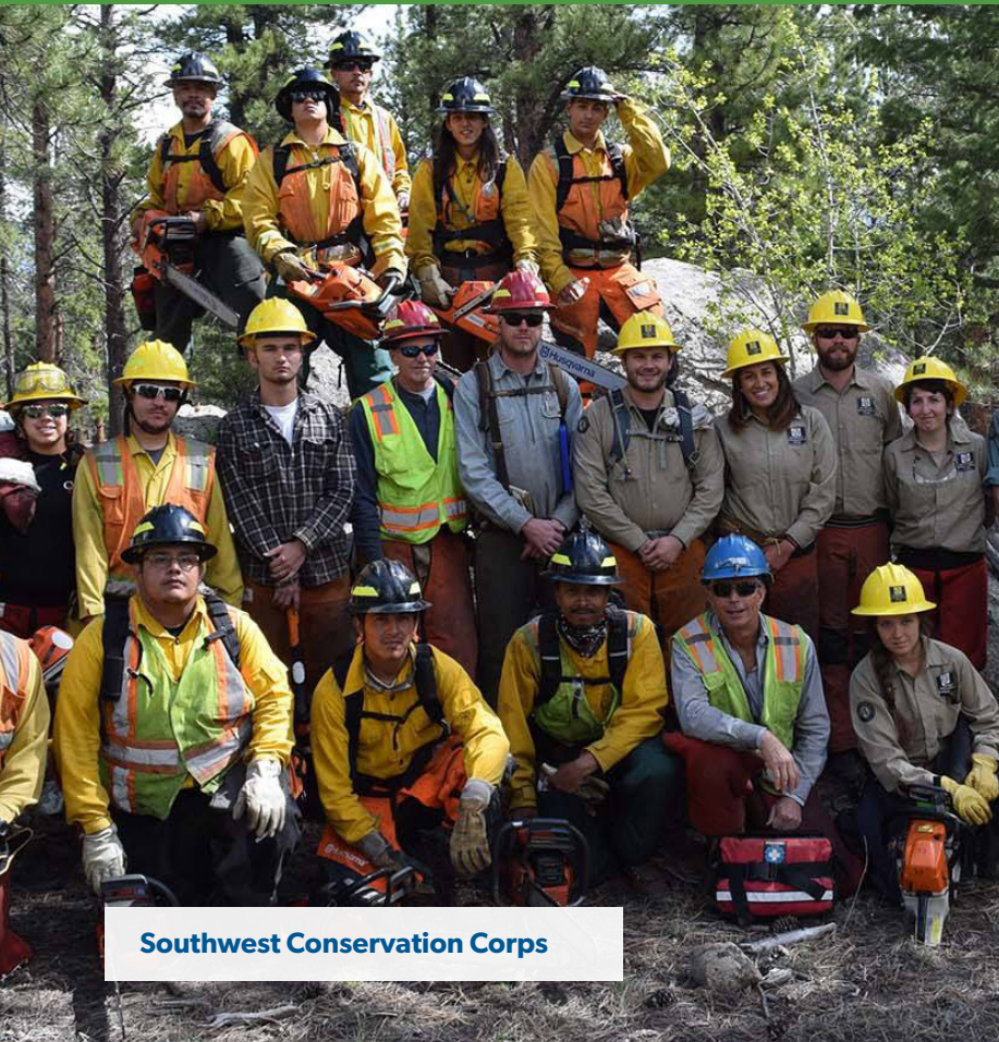
Southwest Conservation Corps