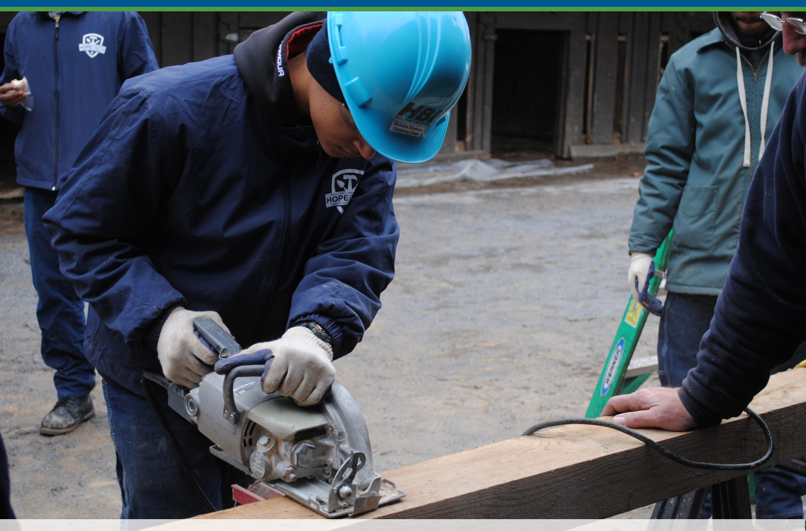
Citizens Conservation Corps (WV)